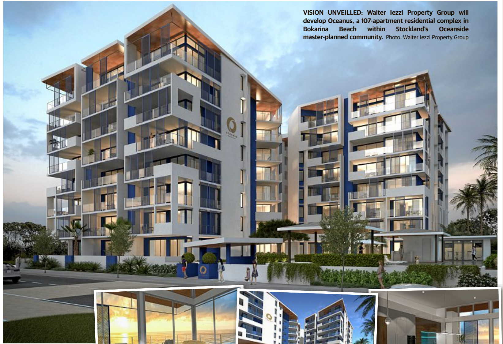
VISION UNVEILED: Walter Iezzi Property Group will develop Oceanus, a 107-apartment residential complex in Bokarina Beach within Stockland's Oceanside master-planned community.

Developer's vision for his most 'ambitious' project to date